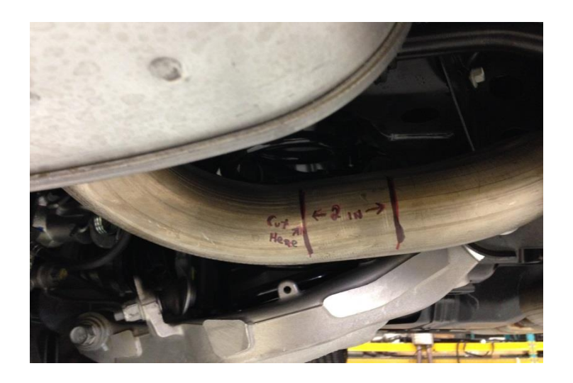
Fig. 1 Drivers side muffler (Cut line is the start of the bend going into the muffler)