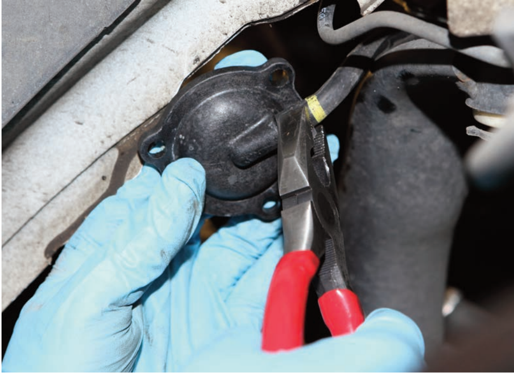
Fig 3) Withdraw the standard valve and disconnect the vacuum pipe using suitable clips on the hose clamp.