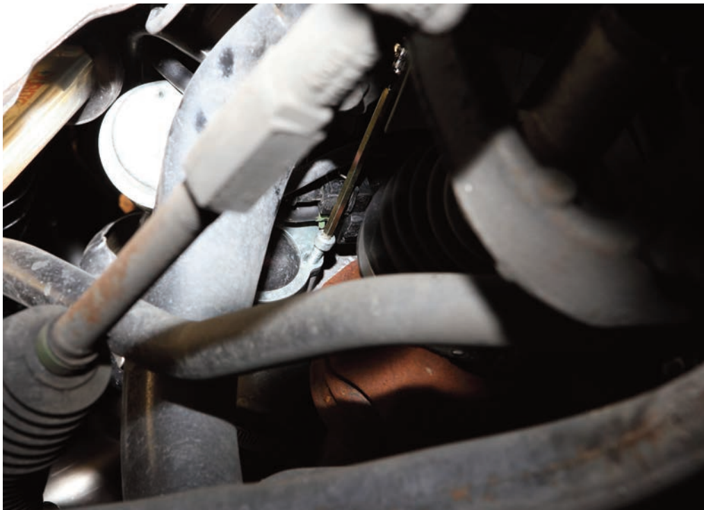
Fig 2) Use a ball-head allen key to undo the three retaining bolts in the standard re-circ valve.

Remove the right wheel to gain access to the re-circ valve through the wheel arch.