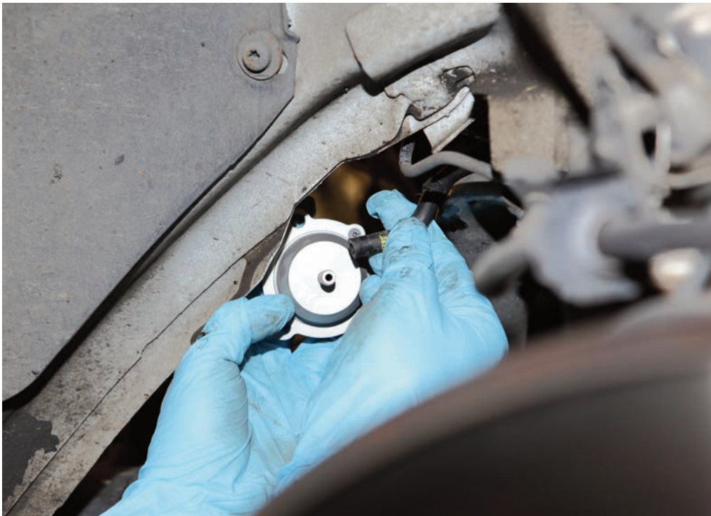
Fig 4) Replace the vacuum hose on the Mountune re-circ valve using the same hose clip.