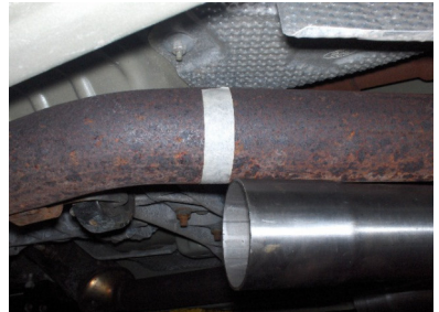
Fig. 5 Fig. 6

STEP 5: Hold up new H-pipe and align with rear of exhaust (See Fig. #5). Mark H-pipe end with tape (See Fig. #6).