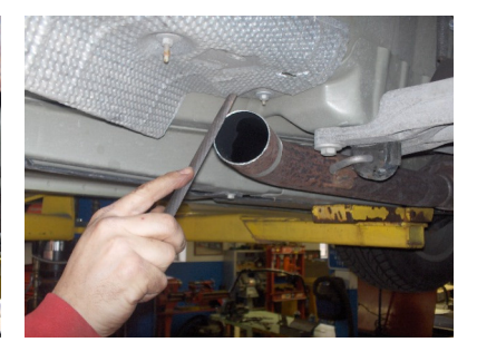
Fig. 7 Fig. 8 Fig. 9

STEP 6: Measure 1-1/2" from end of H-pipe tape mark and make tape cut line (See Fig. 7).