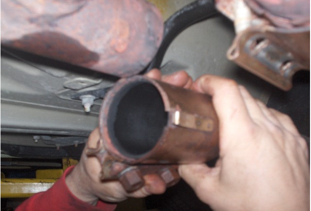
Fig. 3 Fig. 4