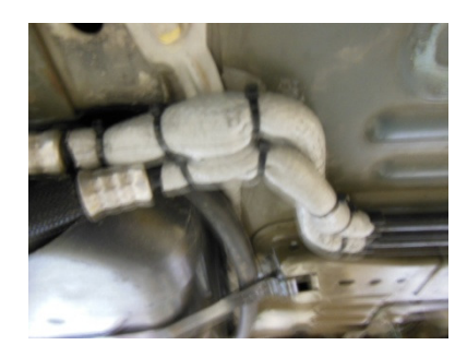
Fig. 14 Fig. 15 Fig. 16

Step 15: Assure proper clearance between rear axle cooler lines and side exhaust. (See Fig. 17)