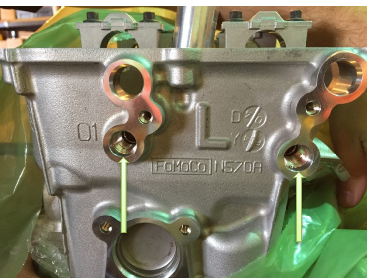
Remove pipe plugs from the rear of cylinder heads.