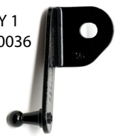
QTY 1 32-00036 Left hand side