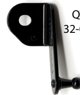
QTY 1 32-00035 Right hand side