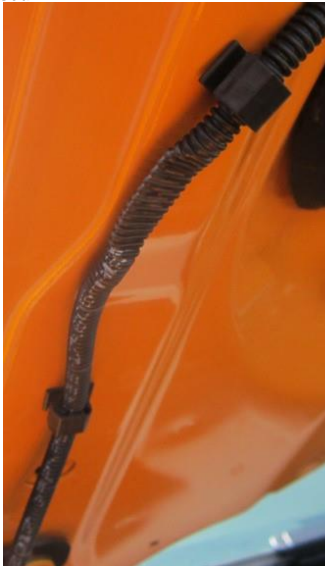
Hose left in stock location, 2018 applications.

Step 9. Relocate washer hose from upper clip to prevent possible interference when the hood is closed.