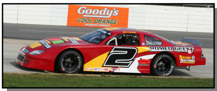
Long Brothers & Setzer – NASCAR Late Model Stock